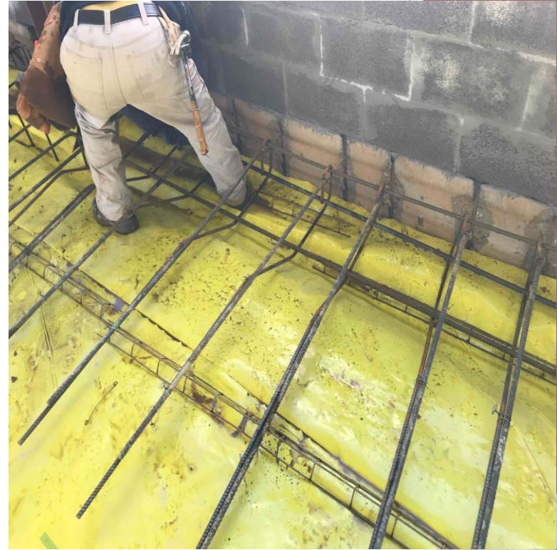
Preparation of portion of 1 st floor slab on grade