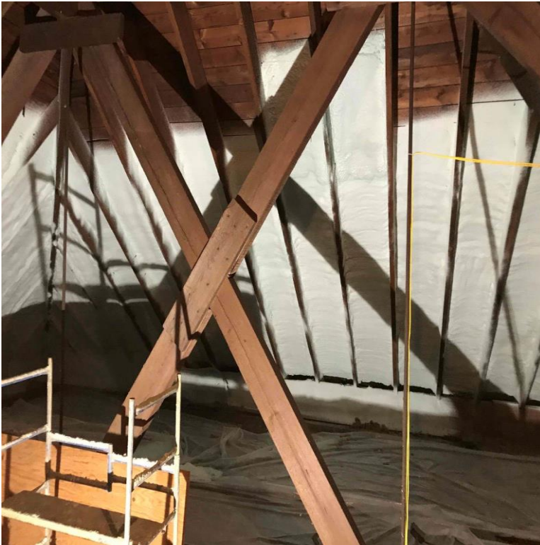
Installation of spray foam insulation within existing attics