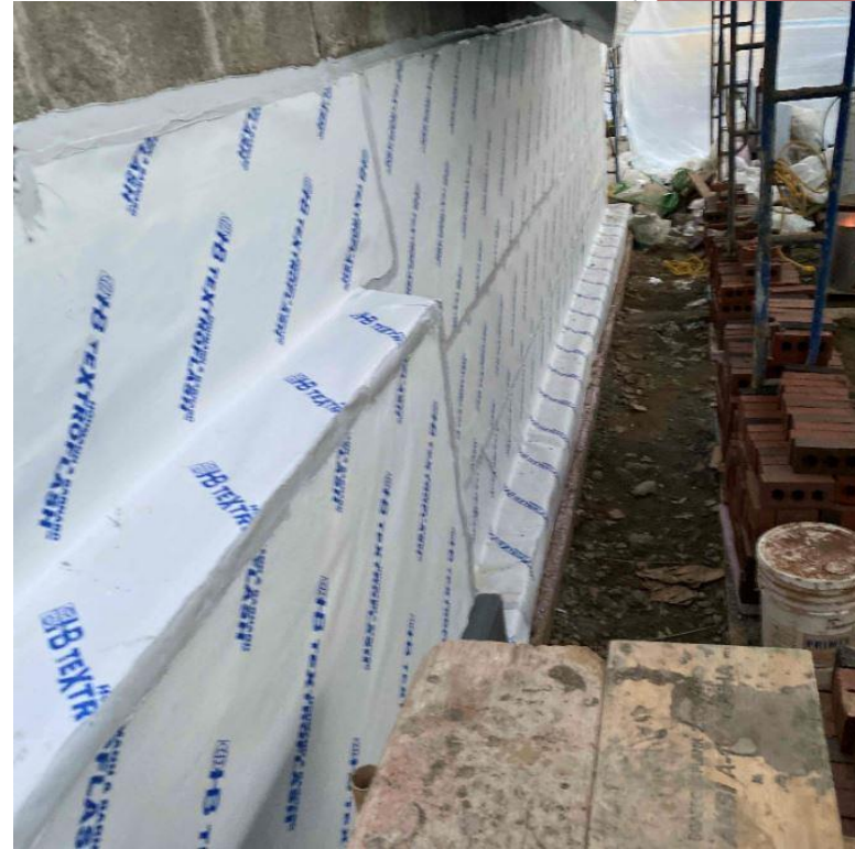
Installation of flashing over CMU new exterior partitions