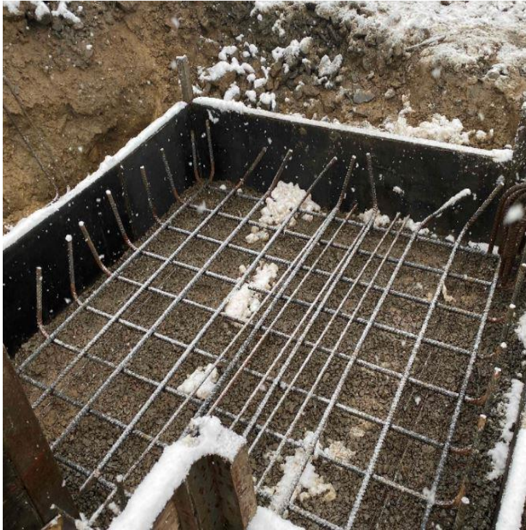
Forming and rebar at proposed footing adjacent to Huntington Ave