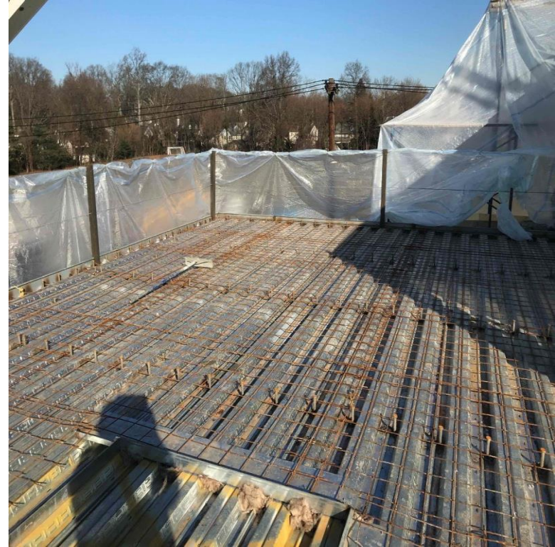
Preparation of attic slab on metal deck