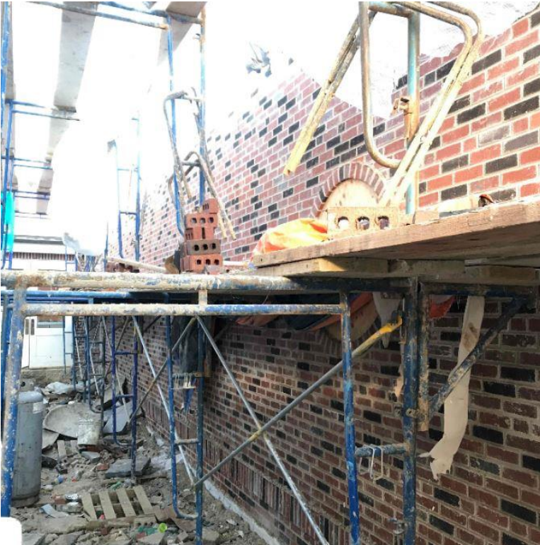
Construction of exterior face brick masonry