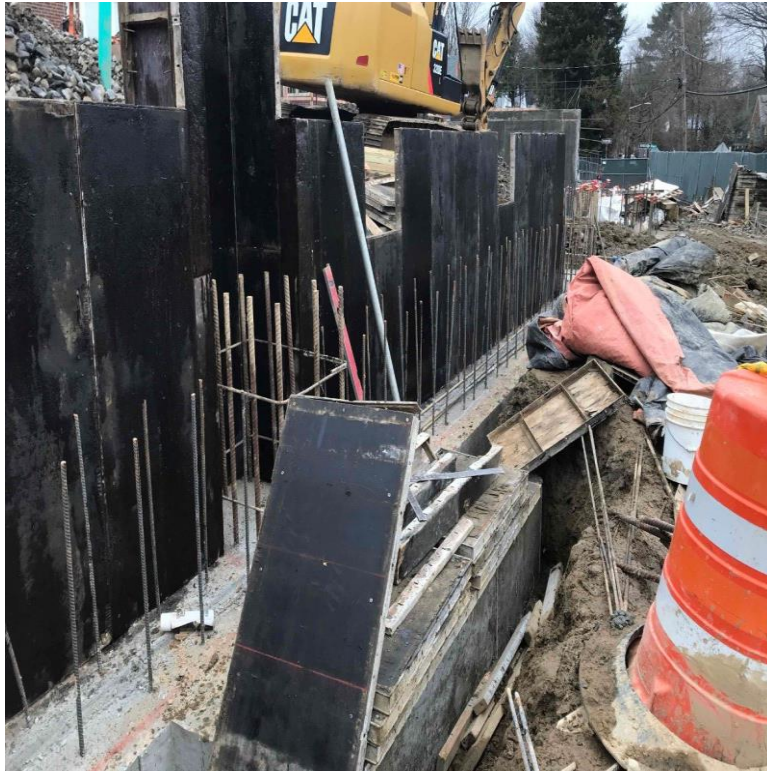
Installation of foundation wall rebar and formwork along Huntington Ave