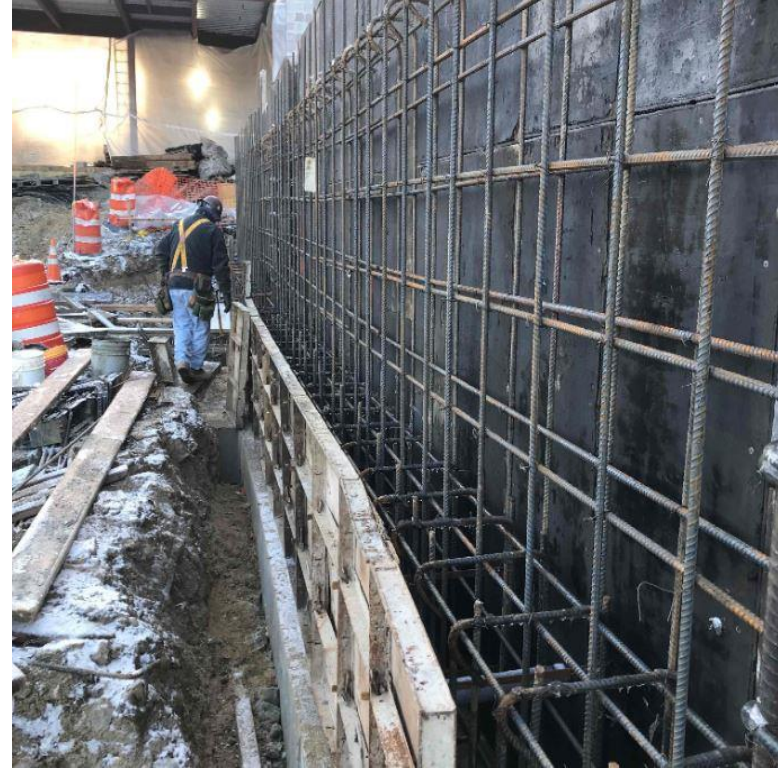
Installation of foundation wall rebar and formwork along Huntington Ave