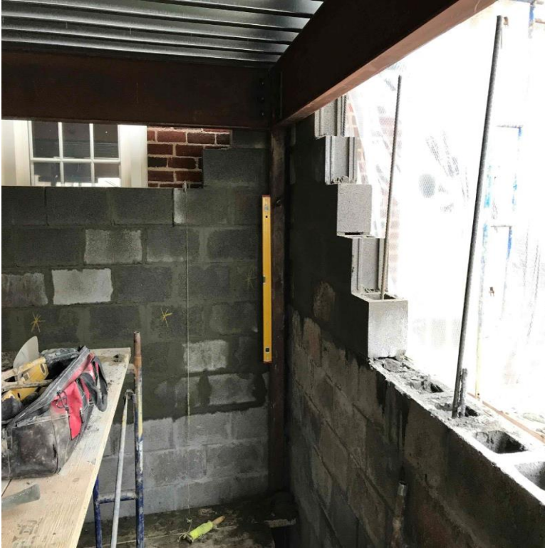
Construction of CMU partition