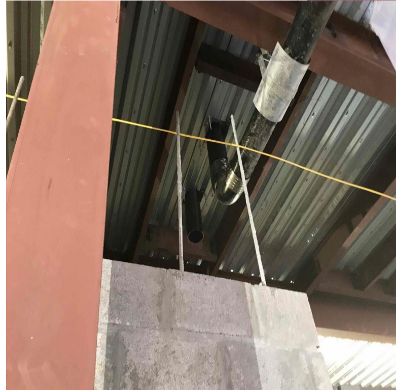
Installation of storm water piping