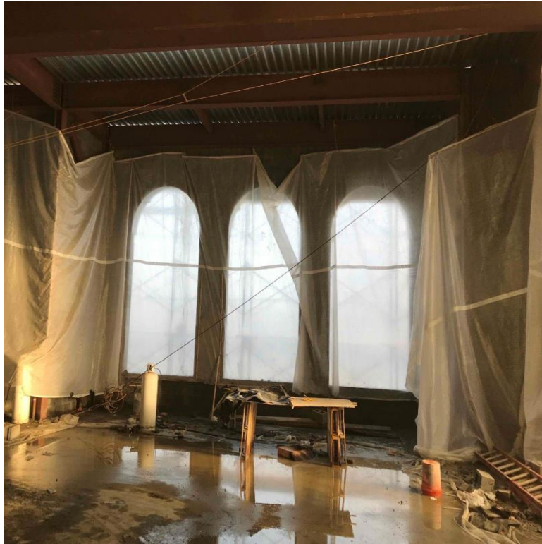
1 st Concrete slab on grade