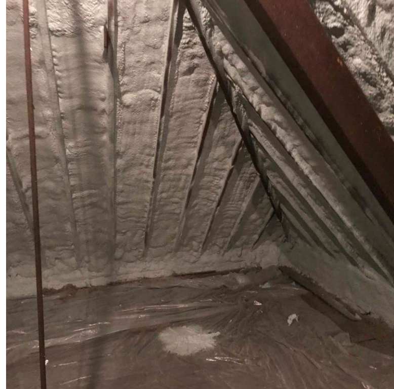
Installation of spray foam insulation within existing attics