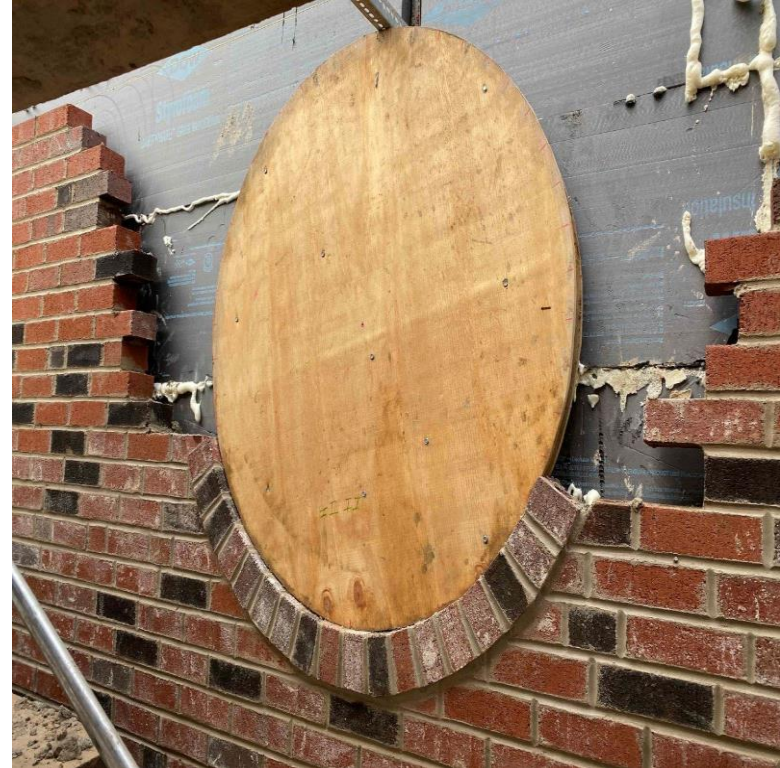
Construction of exterior face brick masonry