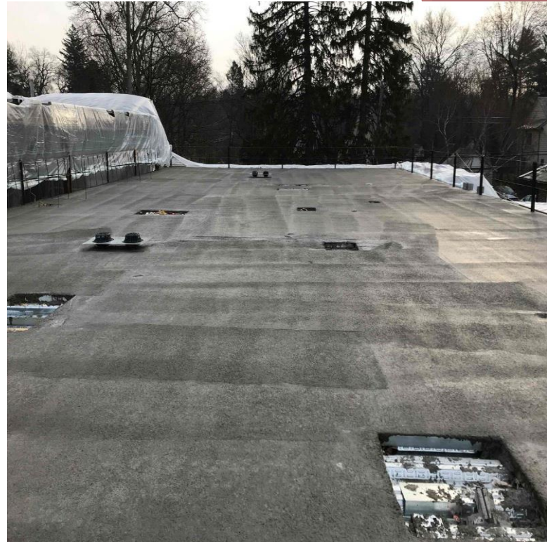
Attic concrete slab on metal deck