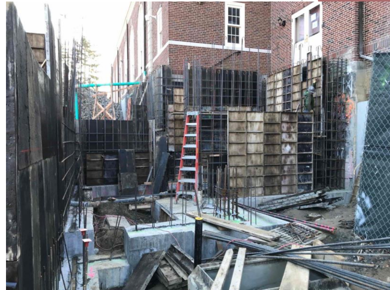
Installation of foundation wall rebar at Stair 163 & Exterior Storage AA2