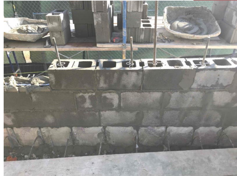
Construction of CMU partitions along Sage Terrace