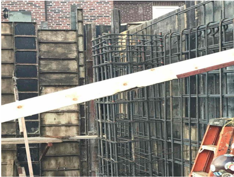
Installation of foundation wall rebar at Stair 163 & Exterior Storage AA2