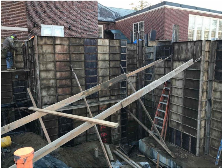
Forming foundation wall at Stair 163 & Exterior Storage AA2