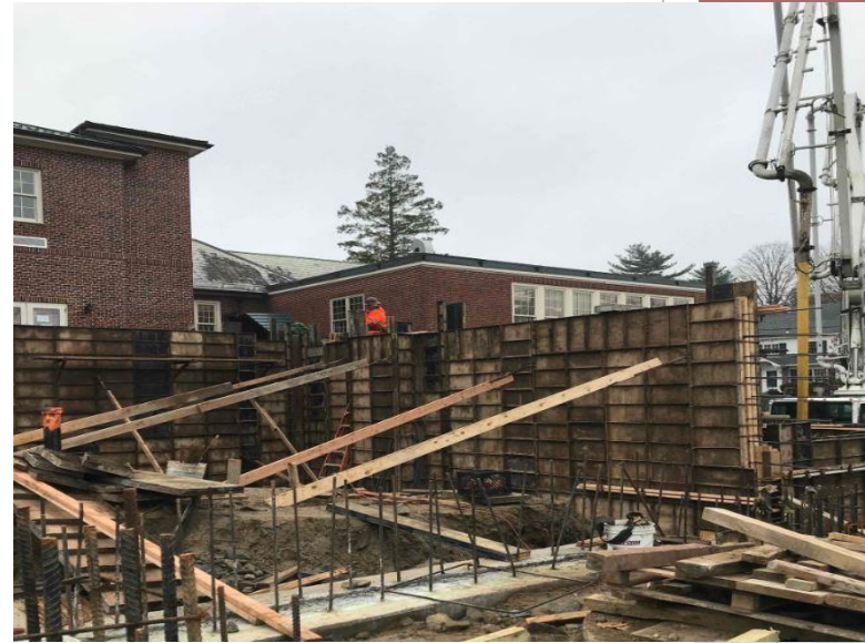
Forming foundation wall at Stair 163 & Exterior Storage AA2