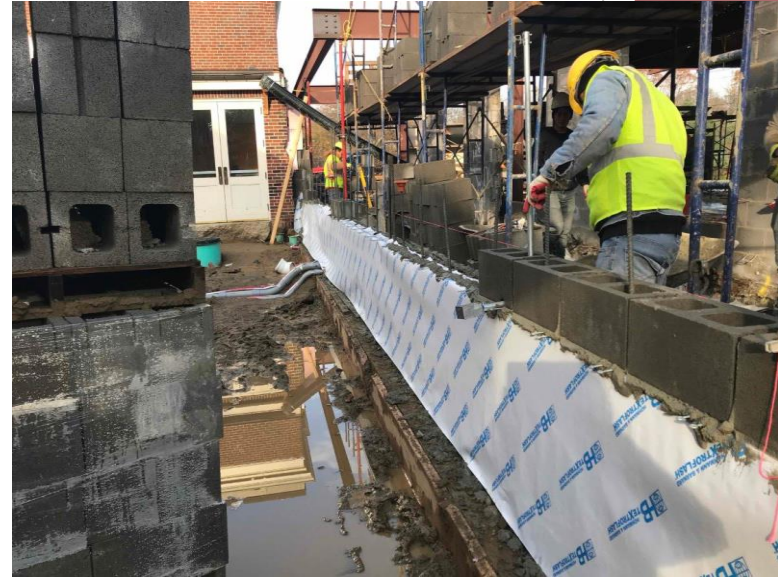
Construction of CMU partition at proposed Multi Purpose Room (between proposed addition & existing building).