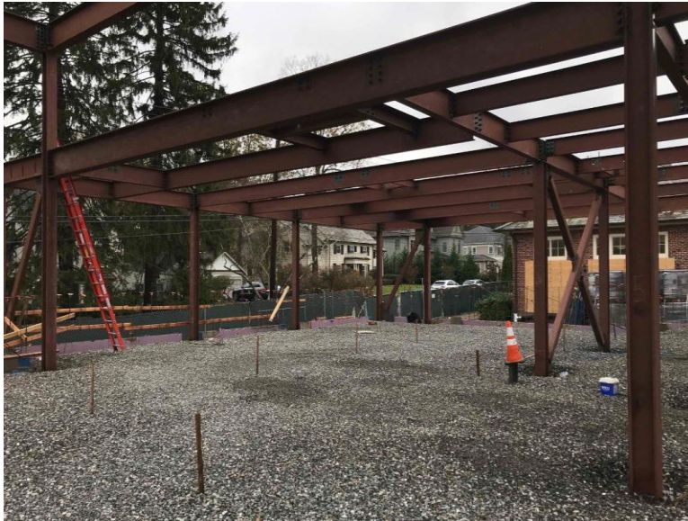
Structural Steel Erection (Sage Terrace & Huntington Avenue)