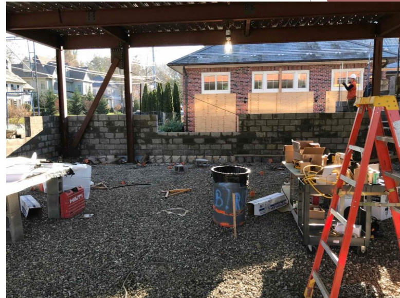
CMU construction & stone base preparation for slab at proposed Multi Purpose Room.