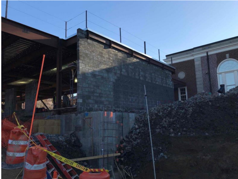
Construction of CMU partition at proposed Storage Room 151.