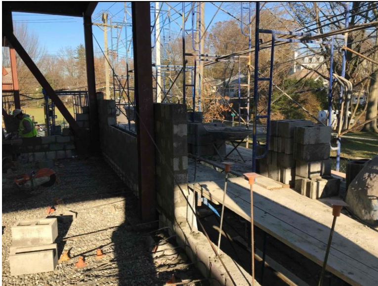
Construction of CMU partitions along Sage Terrace