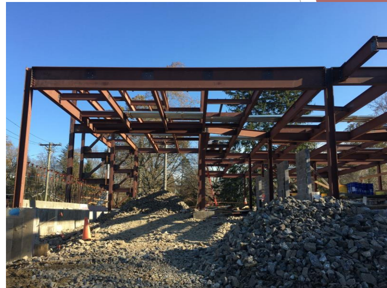
Structural Steel Erection (Sage Terrace & Huntington Avenue)