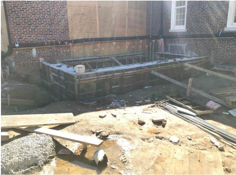
Poured concrete foundation wall at proposed storage room.