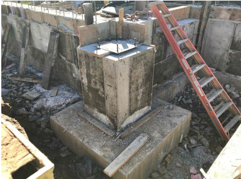
Removal of formwork at proposed concrete foundation walls and pier.