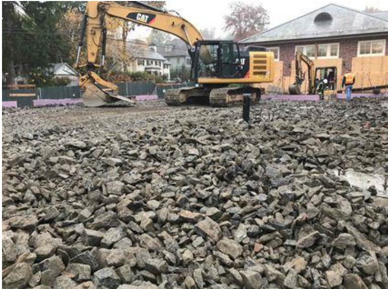
Spreading stone at area of new addition (Sage Terrace & Huntington Avenue)