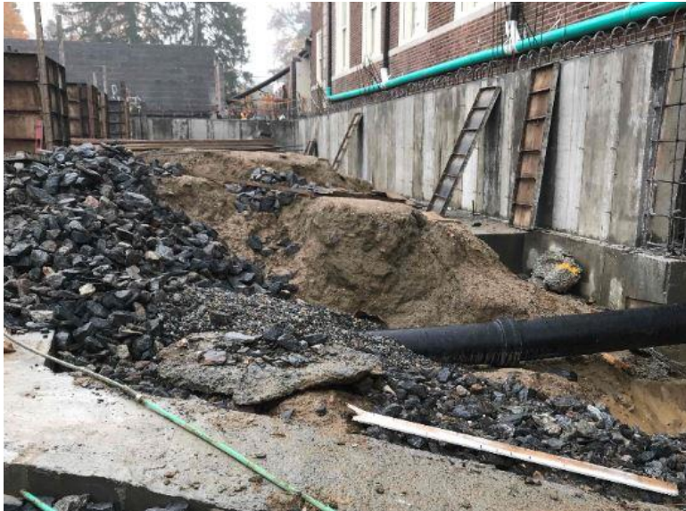
Removal of forms at newly poured wall adjacent to existing gymnasium.