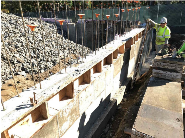
Removal of formwork at proposed concrete foundation.