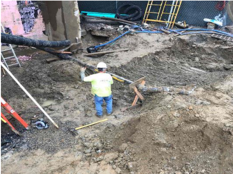
Installation of below grade plumbing piping.