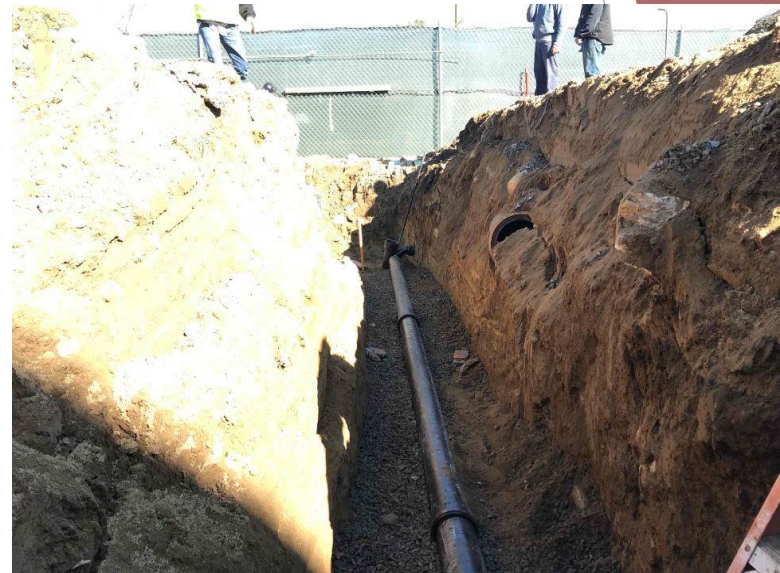
Installation of below grade plumbing piping.