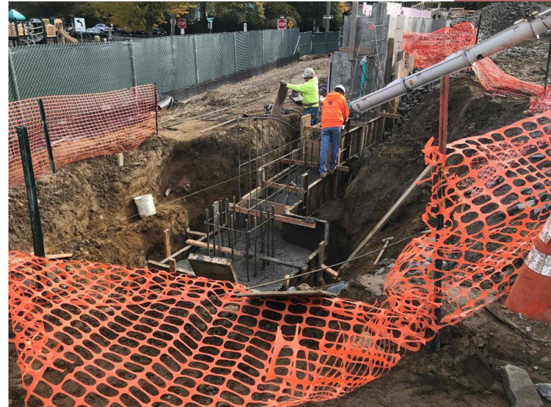
Poured Concrete footing along Huntington Avenue