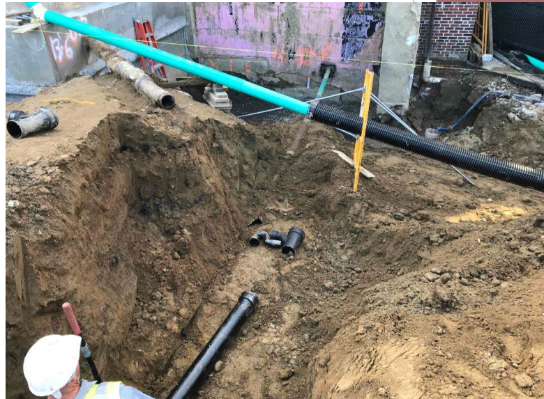
Installation of below grade plumbing piping.