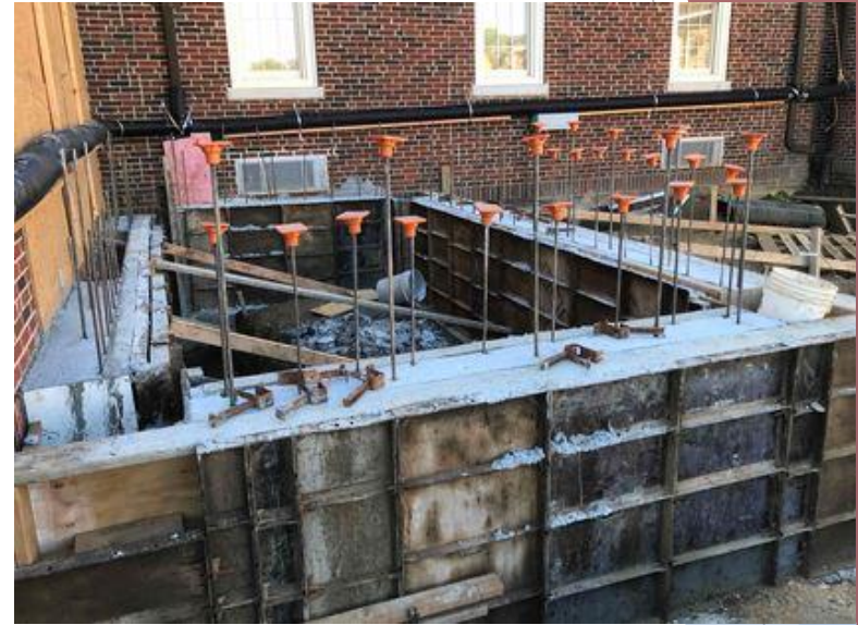
Poured concrete foundation wall at proposed storage room.