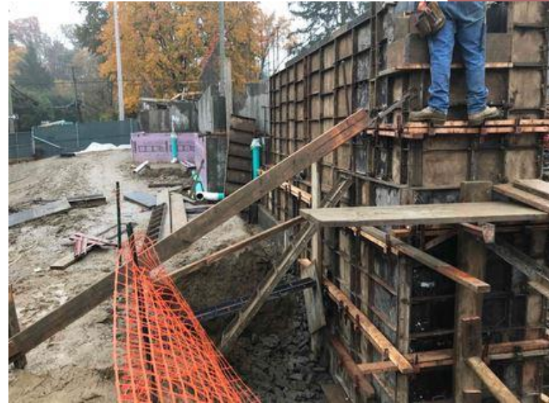
Construction of formwork for proposed foundation walls.