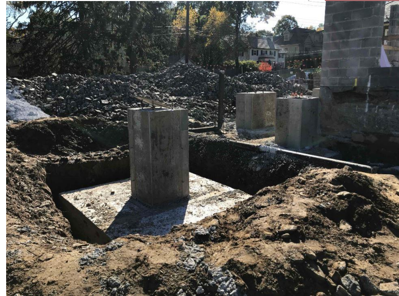
Poured concrete footing and pier adjacent to proposed cafeteria / kitchen area.