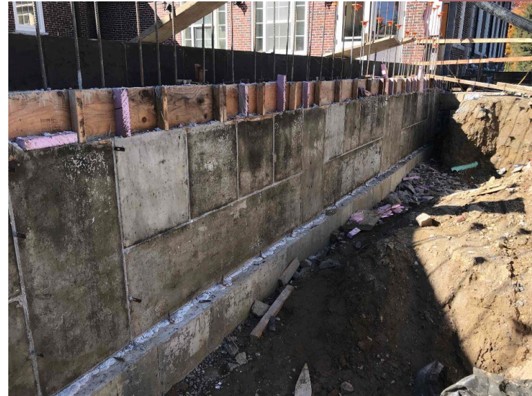
Removal of formwork at poured concrete foundation wall between proposed corridor at proposed kitchen.